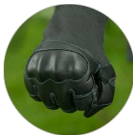
Impacton-PU-Gelenkschutz auf dem Handrücken