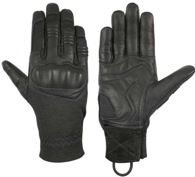
TARA Short Black